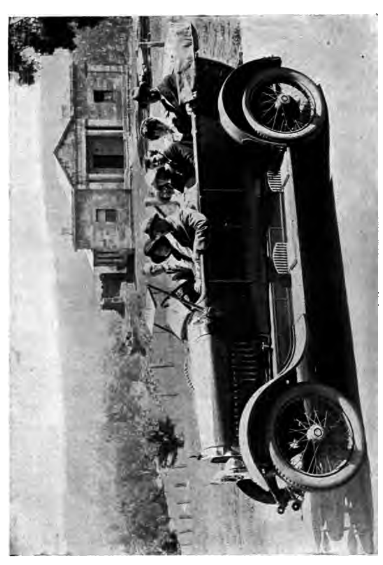
OUR PARTY EN ROUTE TO THE JENOLAN CAVES, JANUARY 20TH, 1921, IN FRONT OF OLD COURT HOUSE IN WHICH BUSHRANGERS WERE TRIED.